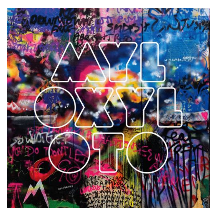
FIGURE 2: Mylo Xyloto album artwork.