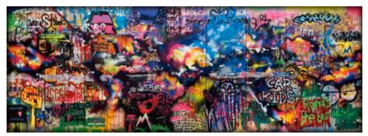
FIGURE 1: Paris, graffiti wall for Mylo Xyloto .