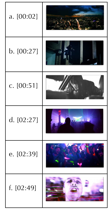
FIGURE 7a-f: "Charlie Brown" music video screenshots.

The style choices and gestures reflect the urban "outsider" theme: the dark clothing and night setting are a foil to the neon lights, graffiti, and Xylobands of the concert setting. The video features Shameless star Elliot Tittensor and Misfits star Antonia Thomas (Curtis Brown 2012). The subject's gestures include a series of parkour movements. Parkour, sometimes referred to as freerunning, is a style of movement, performed by a traceur , that is derived from military obstacle course training (Parkour Generations 2014). It involves climbing walls, vaulting, jumping, and navigating between obstacles. These actions have found their way into popular culture through street performance, film, television and video games. The subject of "Charlie Brown" is a traceur, someone who transgresses physical boundaries and claims his urban space in and through his own physical power. When the subject and his girlfriend arrive at the concert, the physical gestures are those of ecstatic audience members: dancing, spinning, and singing. The musical event is shown as a site of communal power and social liberation, an age-old theme for popular music, to be sure, but one that is given a new millennium context through the representation of technology and contemporary dance culture.