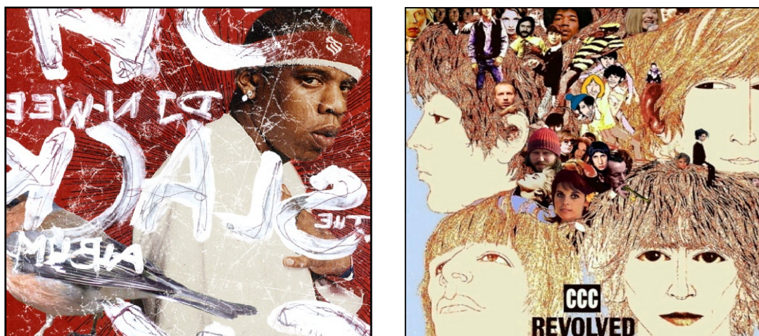
Figure 1: Artwork for DJ N-Wee's The Slack Album and CCC's Revolved 14

Other conceptual album-length mashups include Clayton Counts' track-by-track mashup of the Beach Boys' Pet Sounds (Capitol, 1966) with the Beatles' Sgt Pepper's Lonely Hearts Club Band (Parlophone, 1967) to create Sgt. Petsound's Lonely Hearts Club Band by the Beachles (2006). DJ BC mashed the Beastie Boys with the Beatles to create the albums The Beastles and Let it Beast , whilst CCC's ambitious Revolved and Cracked Pepper utilise a multitude of recordings by other artists to supplement samples from the Beatles' original albums. The practice has expanded to include mashed-up artwork, mashup clubs nights (for example, Bootie in San Francisco, L.A. and New York), video mashups (for example, Like the Way Jenny Scrubs by DJ Earworm), mashup radio and TV shows (for example, Annie Mac's Radio 1 show and MTV Mash ), mashup live bands (for example, Smash-Up Derby) and mashups of mashups (The Hacked! Series). Despite the practice being well established, both historically and within popular culture, 13 mashups operate under a cloud of illegality.