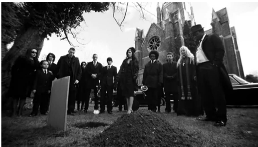
FIGURE 6. Burial of heart or 'thing'. Still from the video for "Back to Black".

I say "thing" here firstly because burial is a particularly Gothic motif. Indeed, Eve Sedgwick has argued that live burial, in particular, can serve as a "metaphor for a repressed thing that threatens to return" (Sedgwick 1986: vi cited in Halberstam 1995: 19). It is also "a particularly powerful way of figuring the erasure of the female self within a construct of marriage which only allowed the legal existence of one person – the husband" (Wallace 2009: 30). So, the gesture of burial in this context references a range of key elements in the Winehouse narrative, not least the continuous return to drugs and alcohol which ultimately claimed her life. Moreover, it can also be understood in female Gothic terms via the association of burial with the interior space of the home. As Wallace notes: