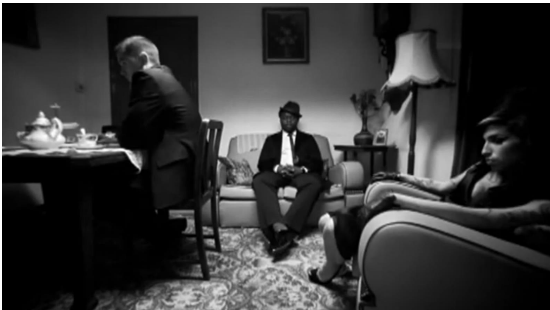
FIGURE 4. Interior mourning scene. Still from the video for "Back to Black".