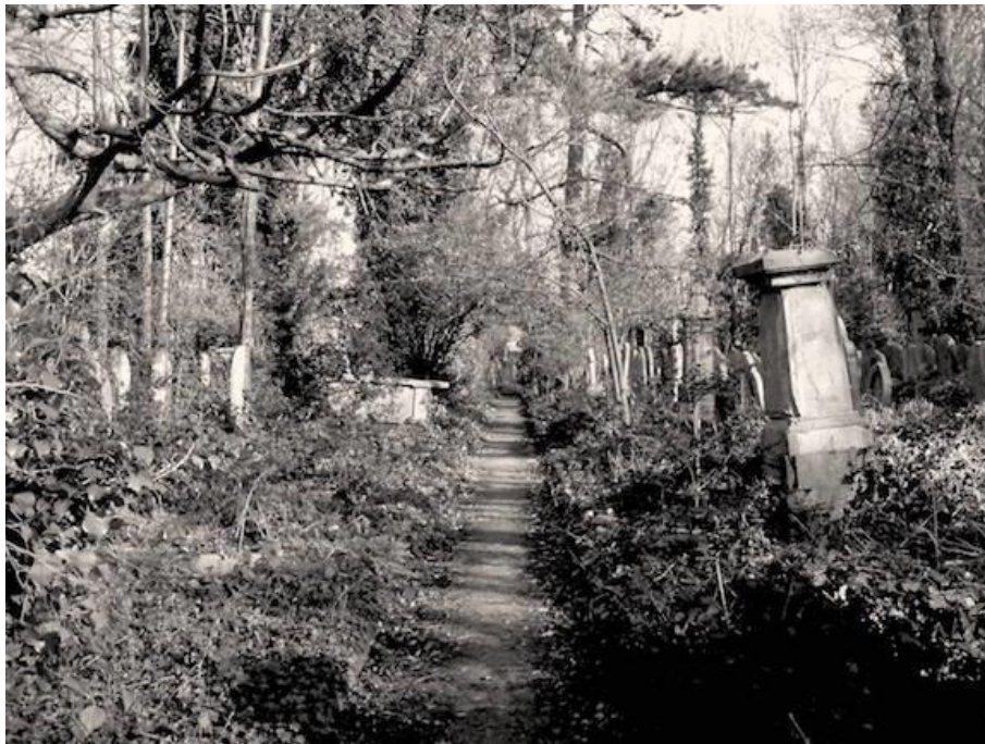
FIGURE 1. Abney Park cemetery, Stoke Newington, North London