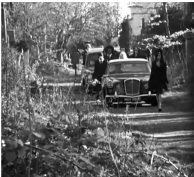
FIGURE 3. Funeral cortege makes its way into Abney Park. Still from the video for “Back to Black”.

The Gothic nature of this text manifests itself in a number of different ways. Firstly, it is shot in black and white producing connotations of an earlier epoch of film and helping form a deliberately noir motif. Indeed, Winehouse’s walk into Abney Park [see Figure 3] is reminiscent of the final scene in “The Third Man” (Carol Reed 1949) where Anna Schmidt (Alida Valli) disappears into the distance after her final exchange with Holly (Joseph Cotton). Fast forwarding thirty years, there is also a strong retro sense of the 1960s and, whilst it was made in colour, Peter Medak’s 1990 biopic “The Krays” (2002).