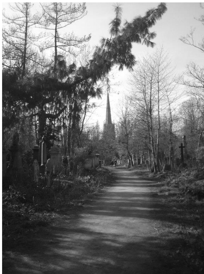
FIGURE 2. Abney Park cemetery chapel