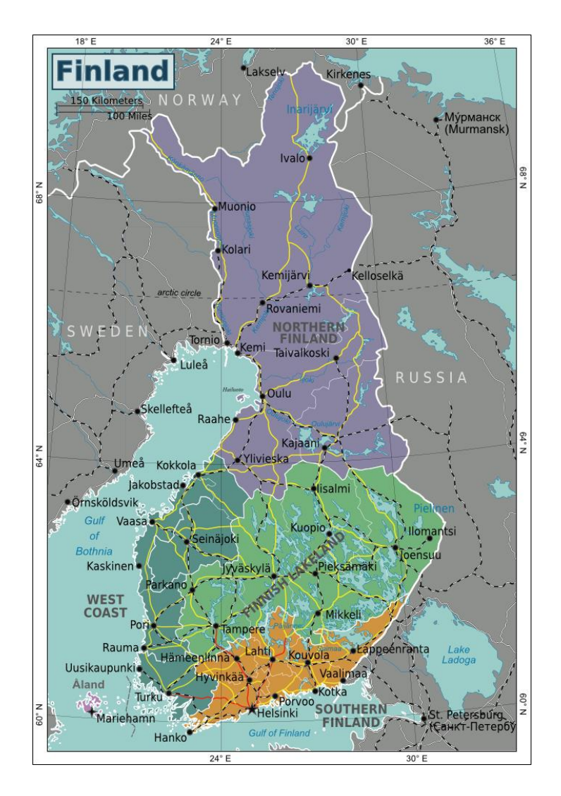
FIGURE 1. Map of Finland (WV 2019)

This outspoken musico-ideological statement was represented also in the association's name. In that respect, it followed the lines of other ELMUs with a slightly ambiguous ambition of improving the quality of music.